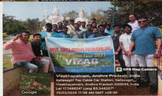
Some snaps during Excursion - 2025