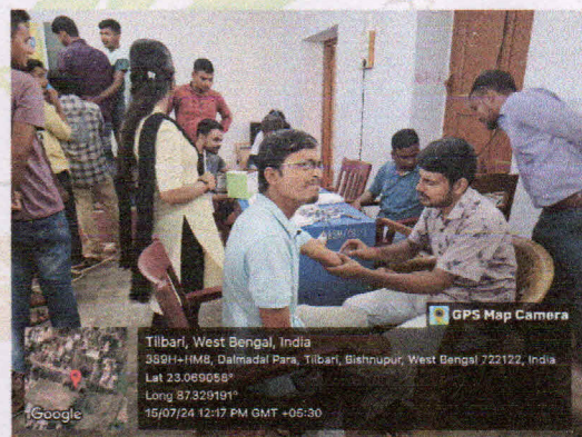
Blood sample collection