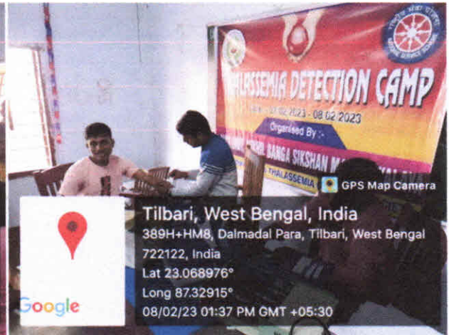
Blood sample collection