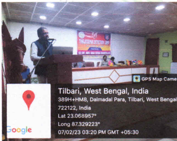
Inaugural speech of Principal