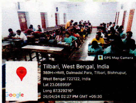
Registration on 26.4.24