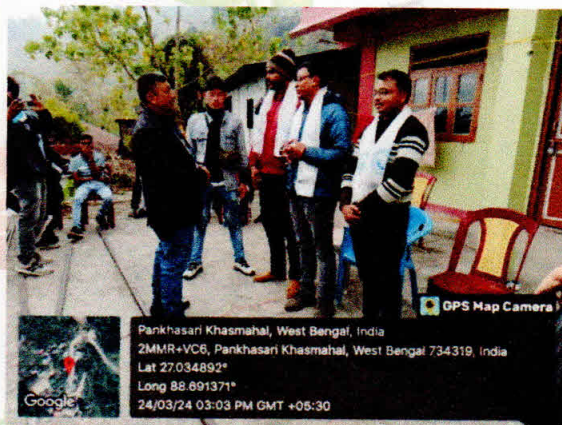
Felicitation by NGO