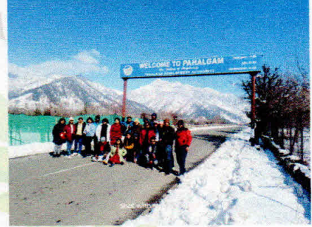
Our students with the lap of Kashmir

Overall programme was beautiful with scenic view of Kashmir and this was excellent experience of B.Ed. Dept of the college.