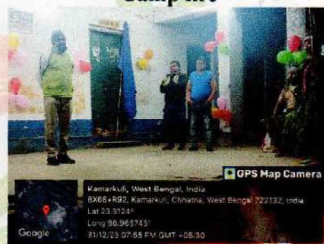
Speech by School representative