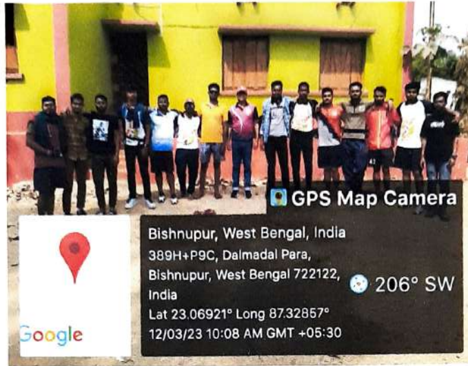
Returning Team NBSM at home