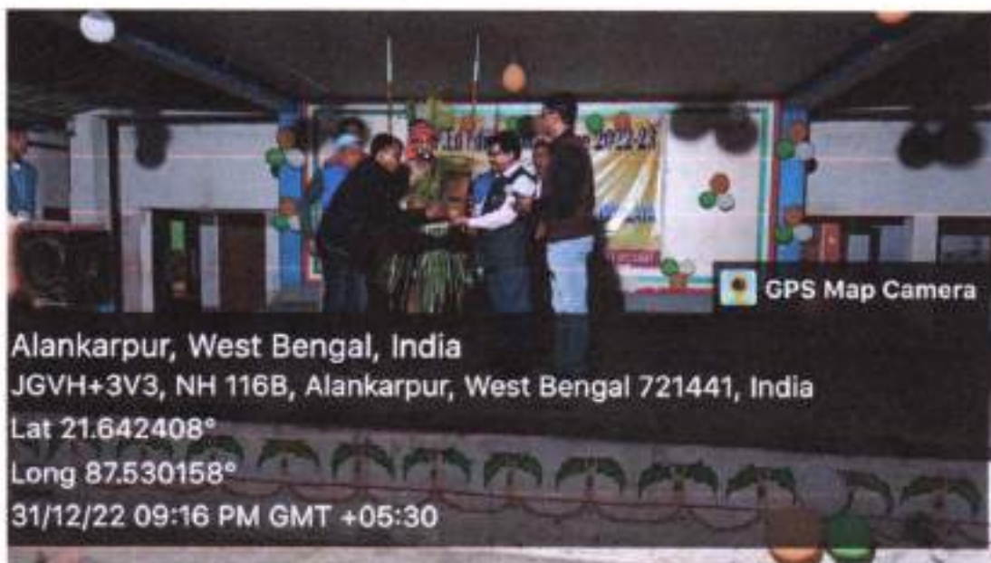
Felicitation to HM, Digha Viyabhawan

We teachers and students were celebrate on 12 o clock new year celebration-2023