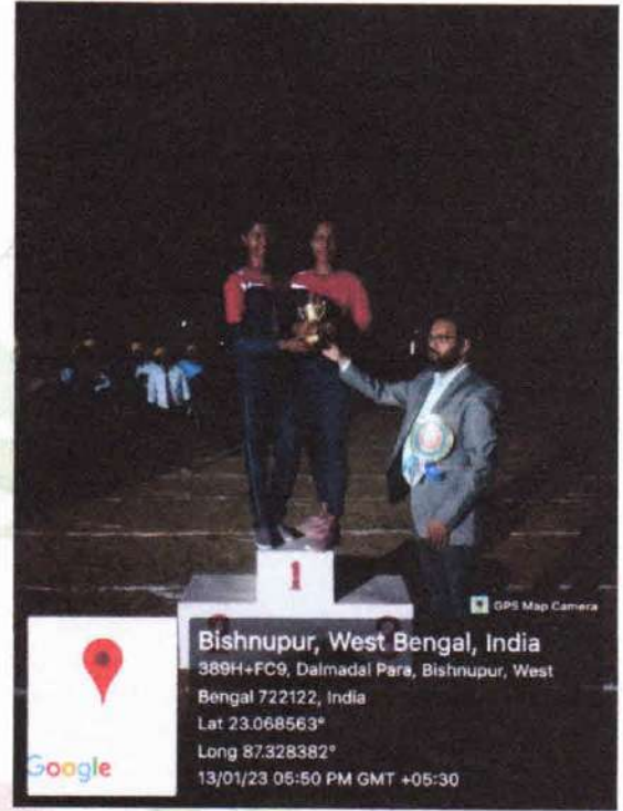
Best Athlete (Women) from SSM