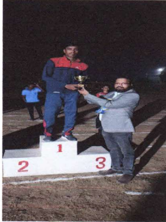
Best Athlete (Men) from NBSM