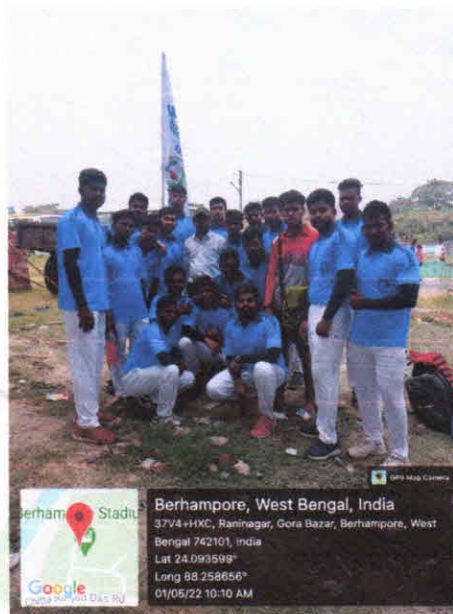
Fig. 1 Team NBSM at UCTC Ground

Phone – (03244) 252001 , 9434202242 : Website - nbsmahavidyalaya.org