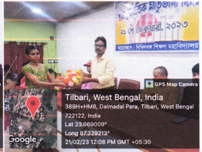
Felicitation of President