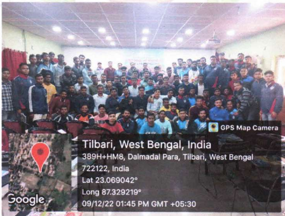
All in a Frame

Conclusion: In this workshop total 112 participants were actively participate out of which 100 from our own Institution, one from Anandam H. S Paul Institute and rest from the department of Physical Education Panskura Banamali College. Feedback of the students implied the grand success of the workshop.