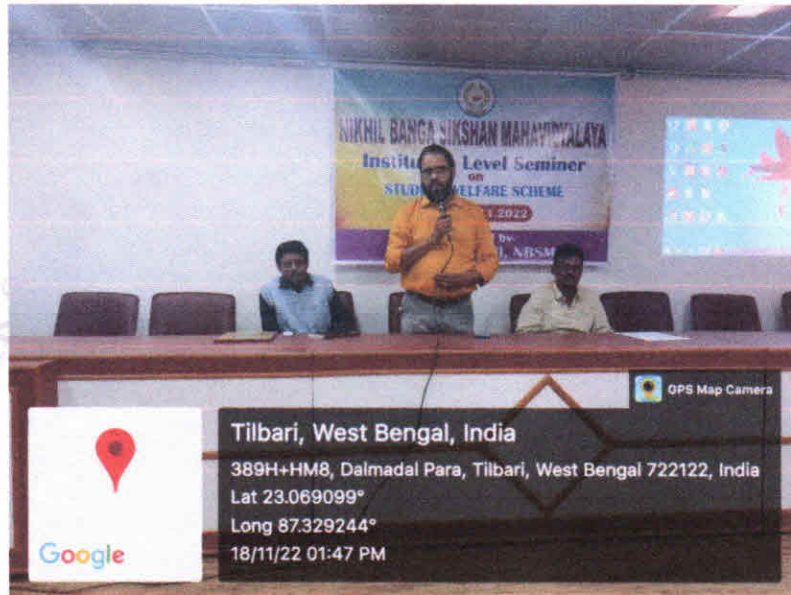
Speech by Princiapal

Attendance of the present students was taken and also photography captured in the session for documentation of the Institutional Level seminar. Others supporting staff were present also for coordination here. We look forward for the next one as same as today.