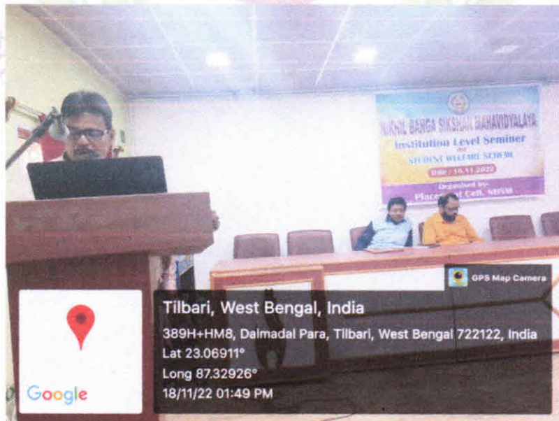
Speech by HOD, Physical Education