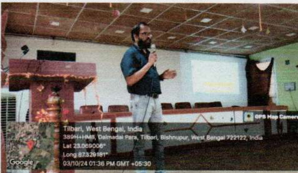
Speech of Principal