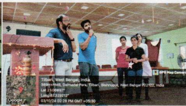
Self introduction by students