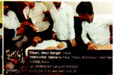
Day 3 & Day 4 programme