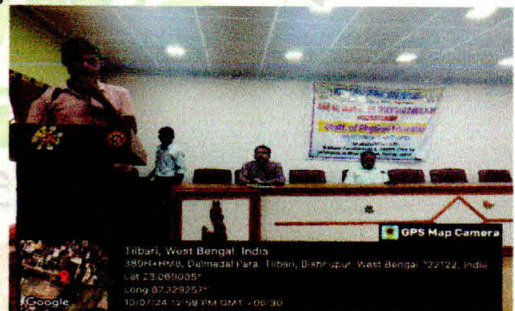
Last Day pogramme

Conclusion: Feedback of the students ensured they have leaned lot of things on Physiotherapy from the course and promise to apply the same when needed.