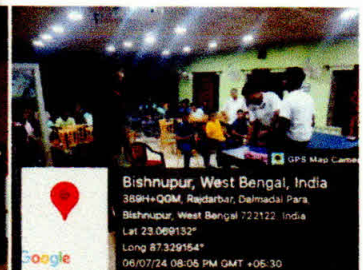
Day 1 & Day 2 Programme