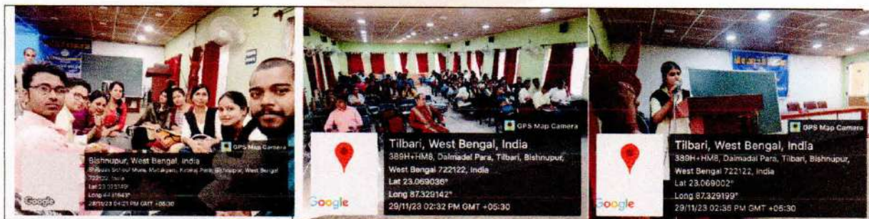
Student participation in LSE

Website- nbsmahavidyalaya.org : e-mail: nbsmahavidyalaya@gmail.com