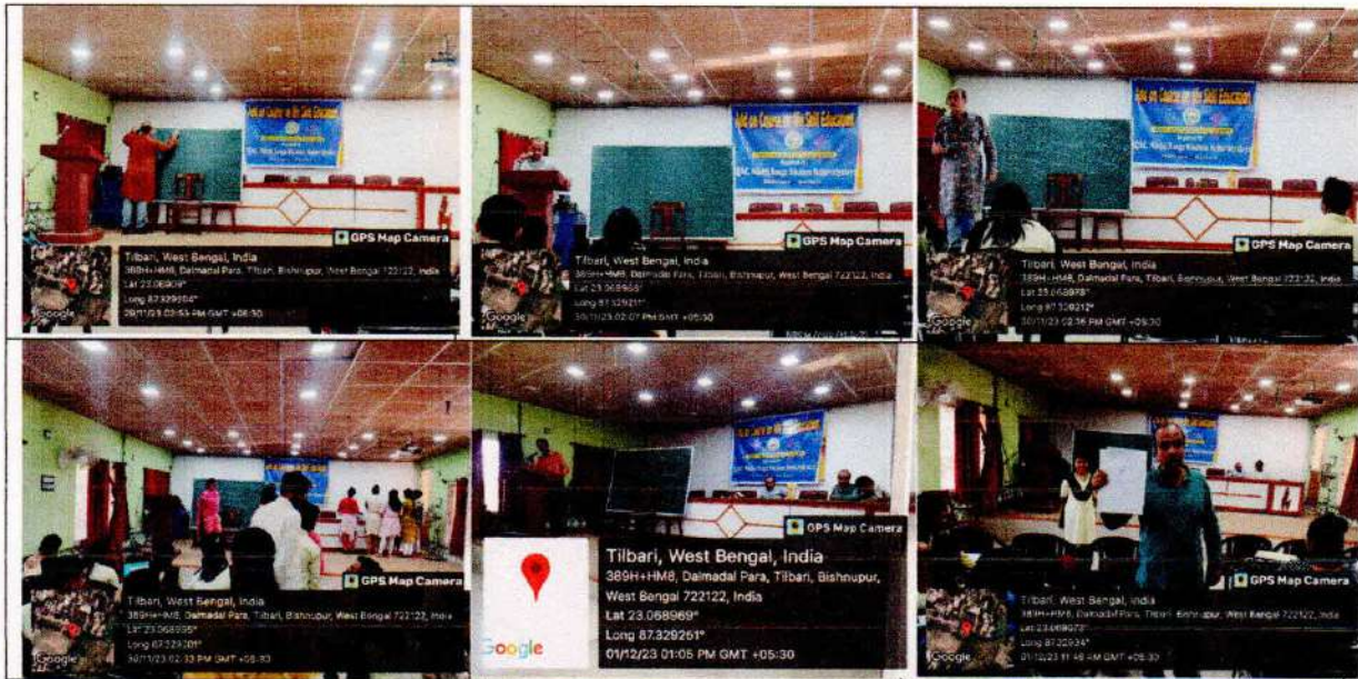
Student Interaction in Add on course