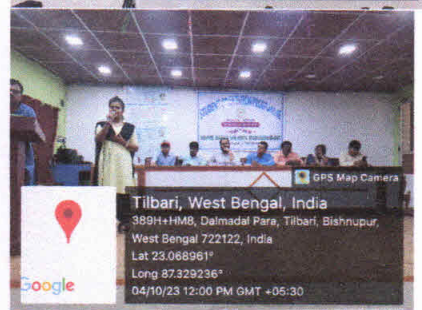
Second day orientation programme