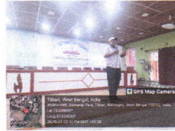
Programme on the concluding Day

At the end of the programme an interaction session with the students has been carried out and their feedback has been collected through Google form.